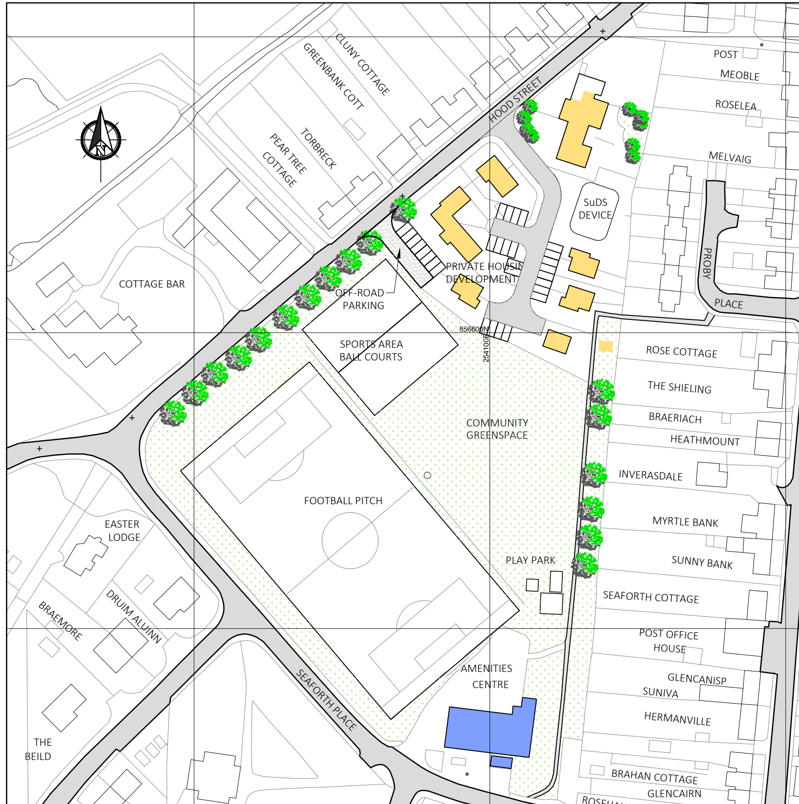
OPTION 2 = COMMUNITY CENTRE RENOVATED & OLD SCHOOL CONVERTED TO FLATS SCALE 1:1,250